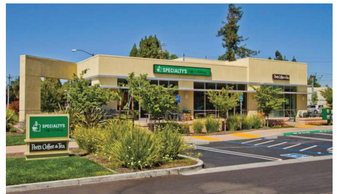
Specialty's Café & Bakery and Peet's Coffee & Tea on site!